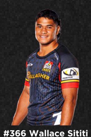
Position: Loose Forward Physical: 1.87m, 113kg